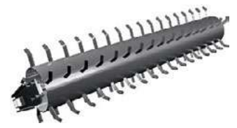
Simple roller Ø 580 mm