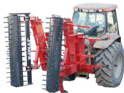
Model RIGEL-9-2V-PC with simple roller \varnothing 580 mm

Models with hydraulic folding also incorporate non-return valves with flow regulators and anti-opening security system .