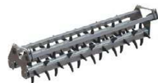
Double roller \varnothing 520 mm