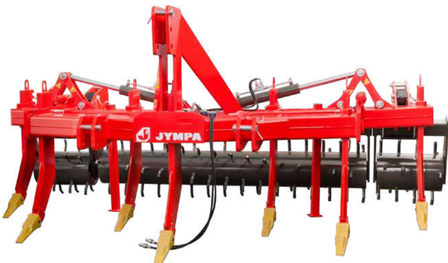
Model RIGEL-7-2V-550-PL with cast steel boots and double roller Ø 580 mm

“Save consumption and doesn’t get clogged”