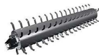
Simple roller \varnothing 580 mm